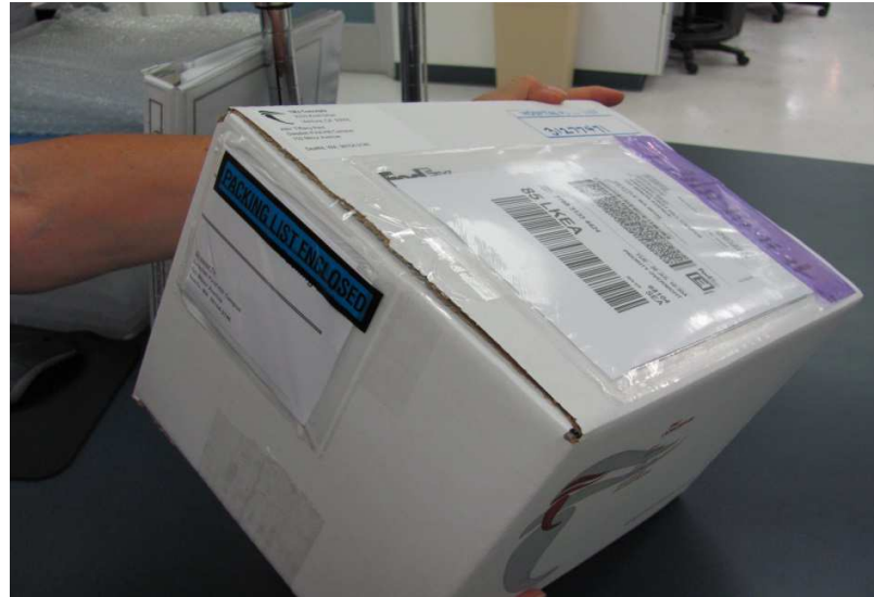
Slide #11: Top & side of Implant Shipping Box.