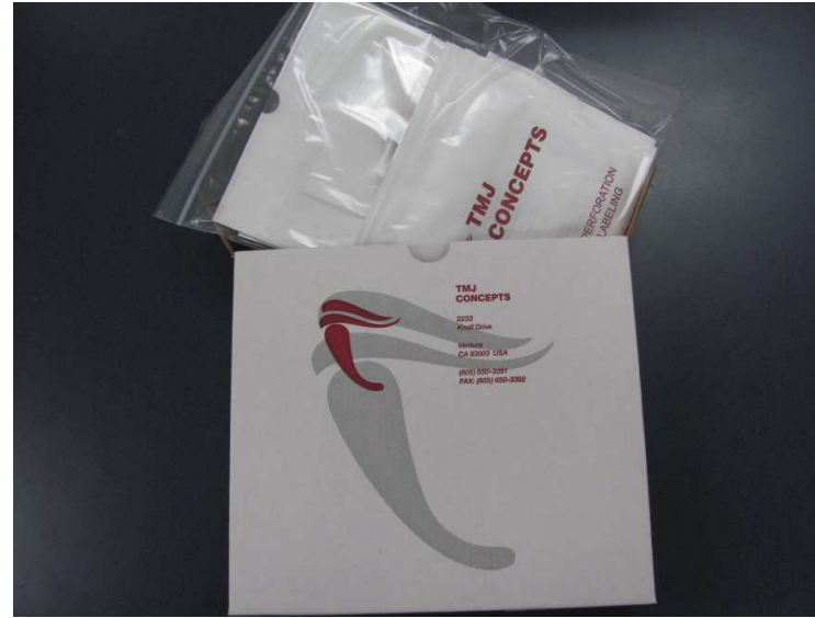
Slide #4: Top of Implant Box.