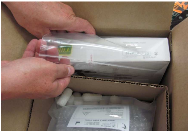
Slide #6: Implant Box with Standard Product wrapped.