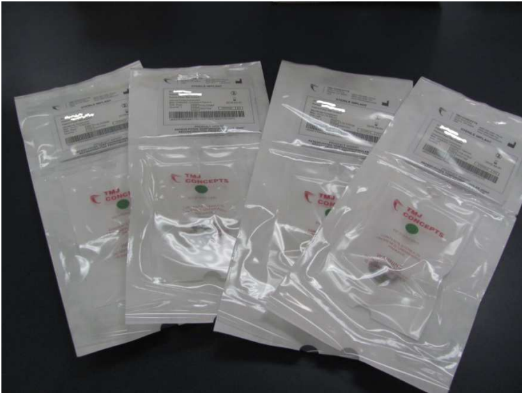
Slide #2: The implant sterile packaging in the bundled bag.