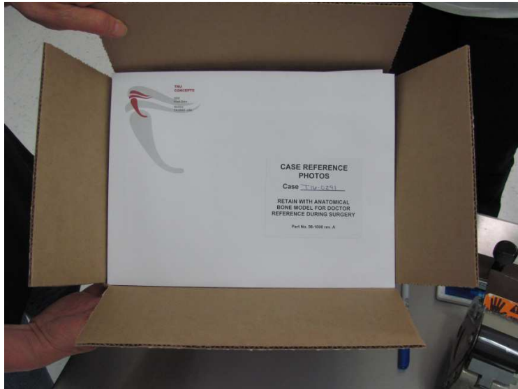
Slide #9: Implant Shipping Box with Case Reference Photos.