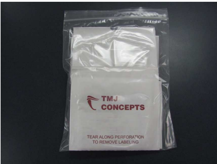
Slide #2: The implant sterile packaging in the bundled bag.