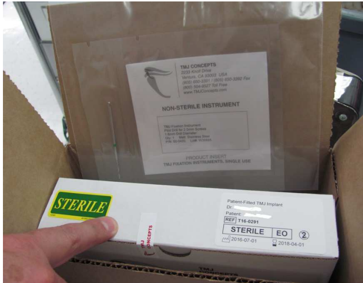
Slide #6: Implant Box with Standard Product wrapped.